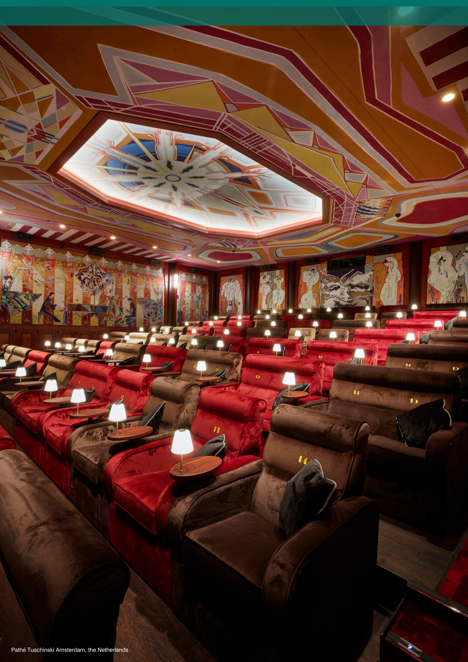
Pathé Tuschinski Amsterdam, the Netherlands