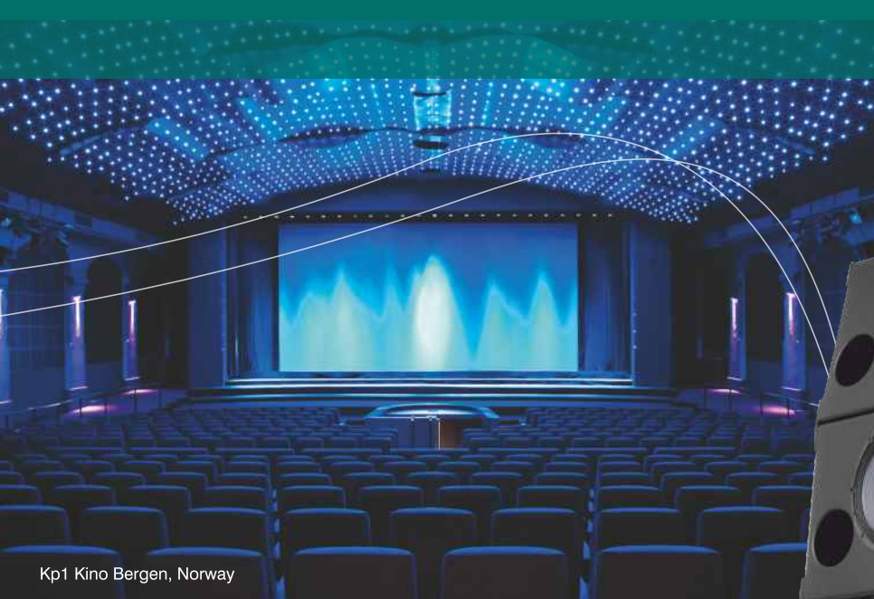
Kp1 Kino Bergen, Norway