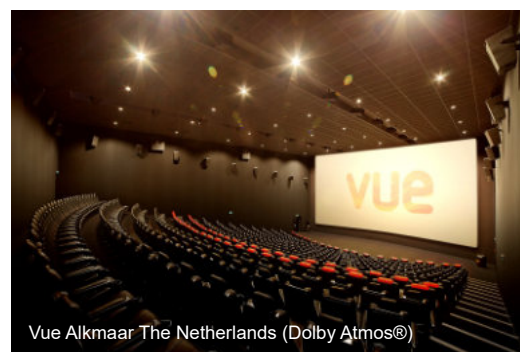
Vue Alkmaar The Netherlands (Dolby Atmos®)

Although young of age, the Alcons company’s systems can be found in reference installations around the globe; Lucasfilm Singapore, Deluxe Digital London, NBC Universal London and Beijing, Berlinale Palast Berlin (Theater am Potsdamer Platz), OsloKino Colosseum Norway, Factory Post studios London, Norwegian Film Institute, Fraunhofer Institute Germany, Savannah Film Festival USA, Pathé cinemas, Vue cinemas The Netherlands, Cinemaxx cineas Mannheim Germany, Eye Filminstitute The Netherlands, QFX cinemas Nepal, FLIX cinema Indonesia to name just a few.