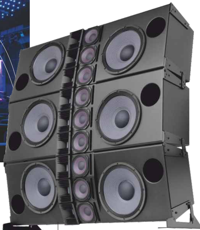
CRA30 Cinemarray™ screen system