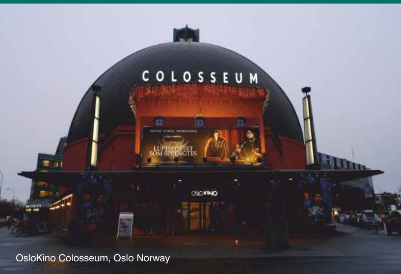
OsloKino Colosseum, Oslo Norway

In short; "You see more of the movie with an Alcons Audio cinema sound system!"