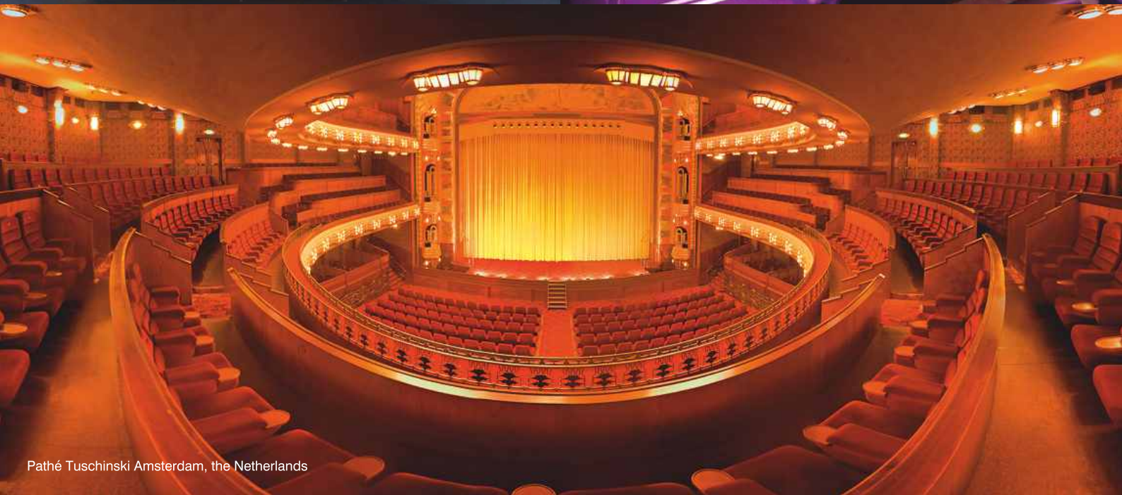
Pathé Tuschinski Amsterdam, the Netherlands