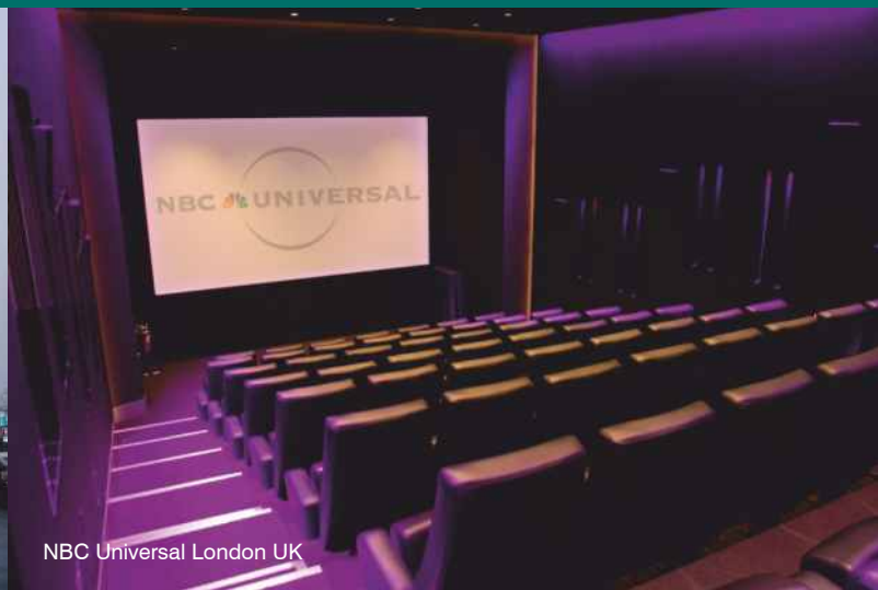
NBC Universal London UK