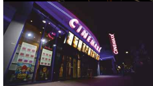
CinemaxX Mannheim Germany