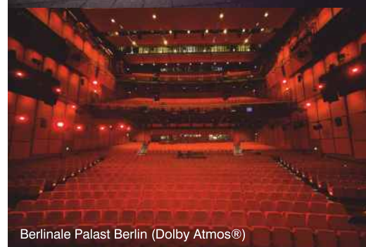
Berlinale Palast Berlin (Dolby Atmos®)