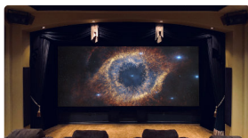
Maninder Chatha, Arizona USA