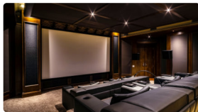
Brad Scott, Florida USA